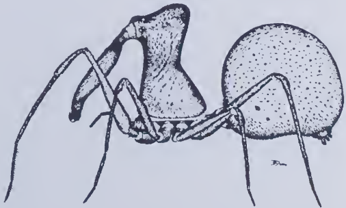
Figure 1 Austrarchaea robinsi sp. nov., holotype ♀, lateral view.

Colour: carapace, chelicerae and sternum